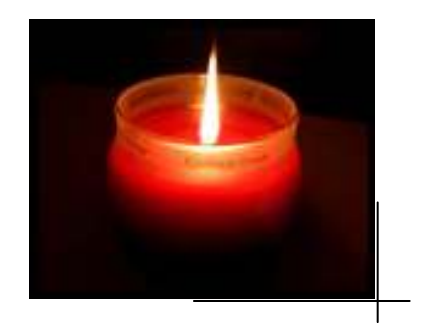
Pain as an example, when it is seen as the calling of body to take a rest, then pain can bring message of peace